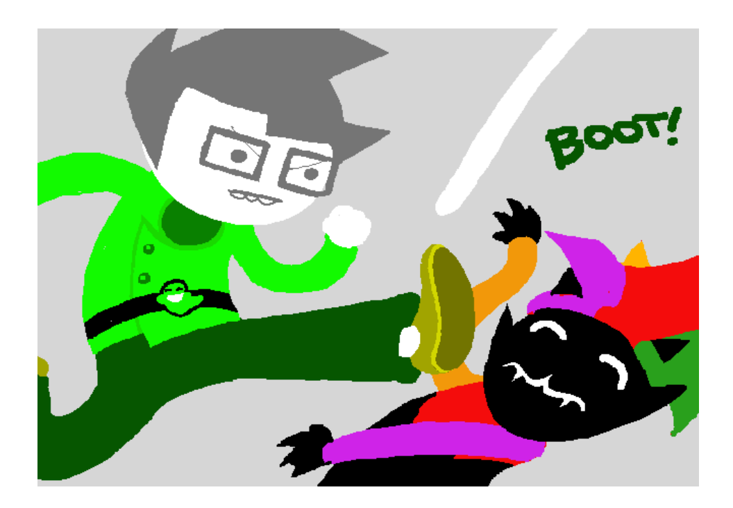
Illustration owned by Andrew Hussie.

Fig. 3 – a simpler panel from that depicts John in a kicking motion (MSPA s=6&p=004579). Note the continued use of his t-shirt symbol in further clothing, and the less rigid structure of his design compared to the previous template versions. Many panels depict the characters in a similar fashion, still non-realistic and resembling their cartoon templates.